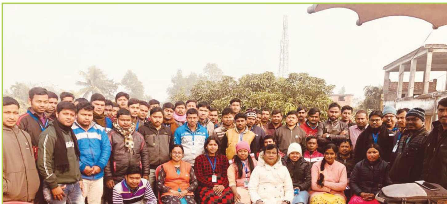
Get Together of Gram Bikash Employees in North Bengal